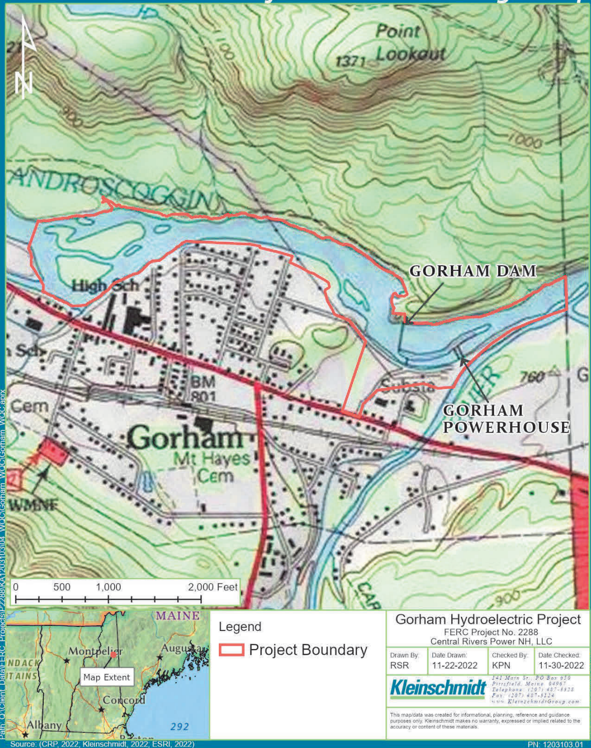
Figure 1. USGS Quadrangle Map of the Gorham Project area.