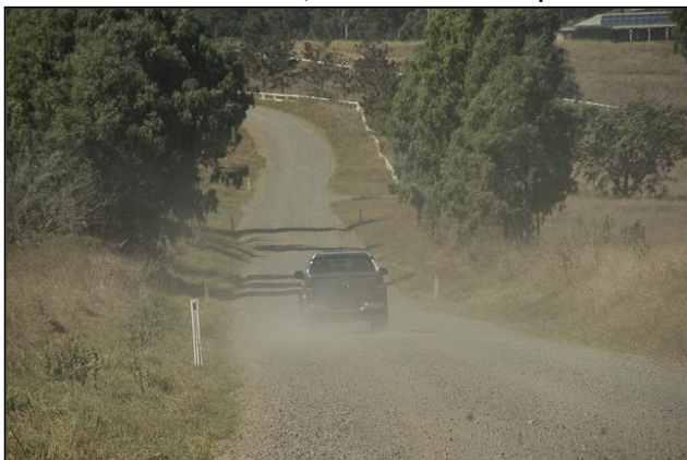
Poor Dust Control Leads to Poor Visibility & Driving Hazards

It is everyone’s responsibility to monitor and note when activities and conditions are present that support the creation of dust. The dust control plan should be written so that everyone understands their duties, what best management practices must be followed, be authorized to take corrective actions to abate dust, and when to report adverse conditions to the project supervisor. Project