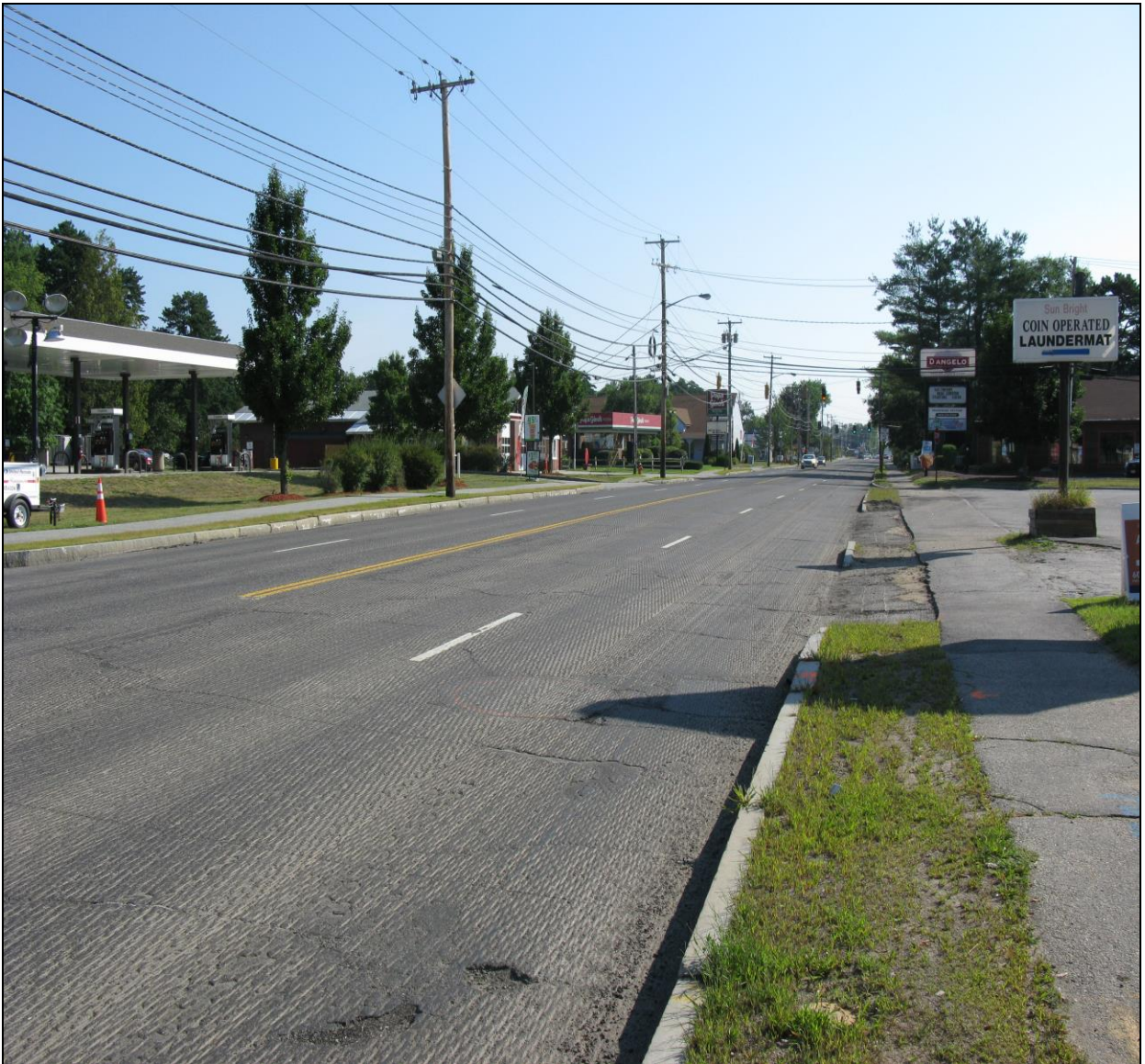
Example of properly-cleaned roadway to eliminate dust from traffic.