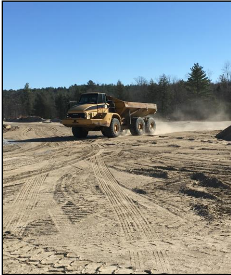
Remember to Control Dust in Storage Yards.

Training is a critical component to your fugitive dust control plan. Supervisors, workers, and subcontractors must be included in the training. Tailgate briefings are a key component of the training and should be held at the beginning of each day's work. Training should include reviewing the work activities and job site conditions that will create dust, the location of public and environmental receptors within the project area, the proper use of equipment and best management practices to prevent and control dust, and when to take corrective actions.