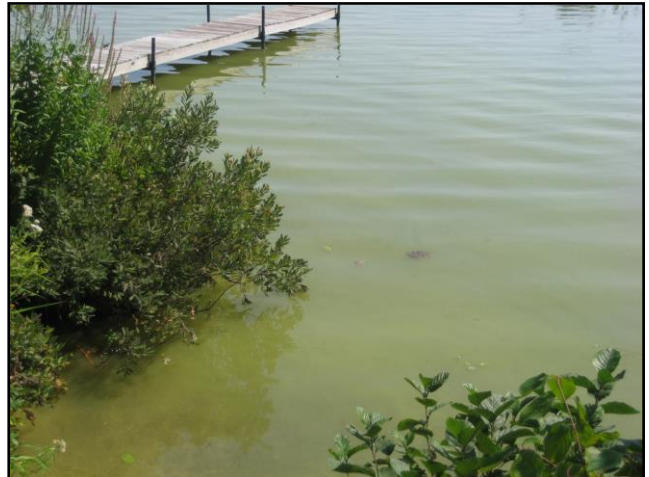
Dust Contains Phosphorus that Leads to Nutrient Loading and Algal Blooms.

Wind generation of dust particles can cause the erosion of valuable topsoil and contribute to the soiling and discoloration of personal property.