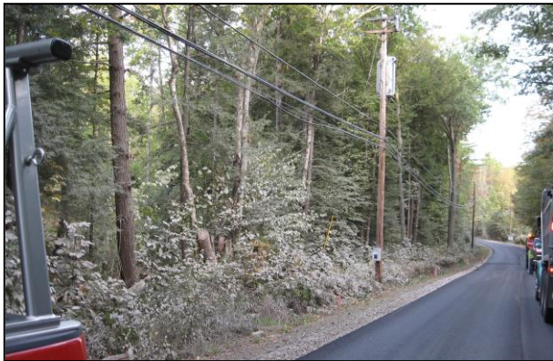
Poor Dust Control is a Public Health Risk, and Impacts Vegetation, and the Environment.

Fugitive dust is an air pollutant generated during commercial or business activities such as sand, gravel and rock-mining operations, paving operations, parking lot and roadway cleaning, and earthmoving operations. It is also generated during loading and unloading of materials, wind-blown from material stockpiles and exposed soils, and from vehicular traffic.