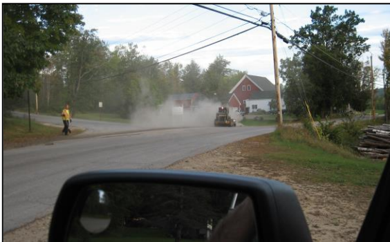
Dust Results in Poor Visibility & Driving Hazards

Dust restricts visibility at the job site and off-site. Reduced visibility creates a safety hazard to workers and to motorists passing by on adjacent roads.